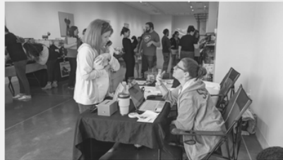
PET SET HOUSTON