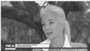
Three soon to be laws will protect pets