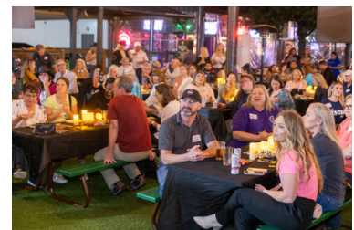
Hundreds of Rescue Partners!