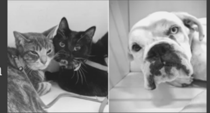
Houston Pet Set

by Sharron Melton Posted: Jul 27, 2023 / 06:42 AM CDT Updated: Jul 27, 2023 / 06:42 AM CDT