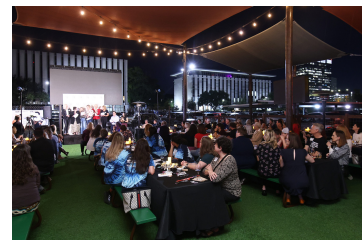
Hundreds of Rescue Partners!