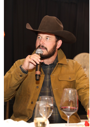
Celebrity Guest Cole Hauser